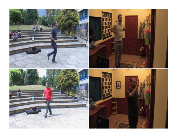
Fig. 1. Example frames from the IMPART video dataset. The respective activities are "Run" (top left), "Walk" (bottom left), "Jump" (top right) and "Hand-wave" (bottom right).

Thus each script was executed three times per actor. Three main actions were performed, namely "Walk", "Hand-wave" and "Run", while additional distractor actions were also included and jointly categorized as "Other" (e.g., "Jump Up-Down", "Jump Forward",