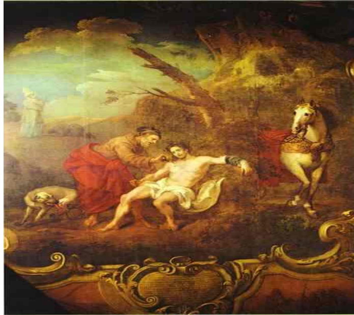
The Good Samaritan 1

25 A teacher of the Law came up and tried to trap Jesus. “Teacher,” he asked, “what must I do to receive eternal life?”