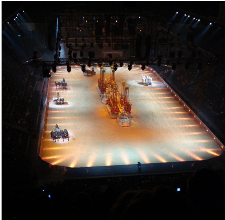
fig. 12 Ben Hur Live at the O2, London, 2009

On the night I saw the show, the audience mostly watched the race as if it was part of a play but some cheered on Ben-Hur as if it were a live sporting event, the outcome of which was yet to be determined. There was, however, little dramatic tension as, although the scene was surely difficult and dangerous to perform, compared to the film this race looked slow. In the arena the producers of the show cannot play with space as Wallace did in the novel, or filmmakers have done since (including the makers of the trailer discussed above). Whereas the film sequences rely on crosscutting shots of the various racers, close-ups of action, details of horses and chariot wheels, in the arena each spectator is has to be content with their one viewpoint, even if they can direct their attention as they please. The film images remain ‘incomparable pictures’ after all; the screen-barrier remains intact. This is the post-cinematic screen barrier, where the world viewed is still screened from the viewer. Here the screening is not inherently temporal, but rather grounded in the always already seen source material for an adaptation.