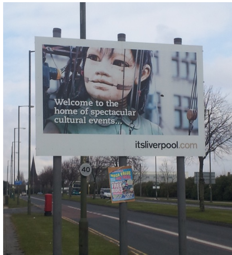
fig. 20 Advert promoting Liverpool as a tourist destination, 2014

that models the commercial profitability of entertainment retail to the world' (Susan Bennet, 2005: 418).