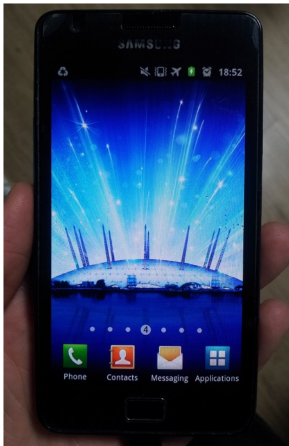
fig. 19 Pre-set 'home screen' on Samsung mobile phone on O2 network, 2012

phone. How, then, does the O2 become both a successful venue and a positive image used in this kind of promotion?