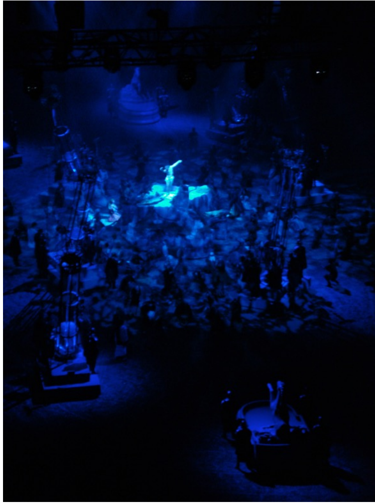
fig. 3 Crucifixion scene, Ben Hur Live , 2009

Director Franz Abraham himself described it thus: