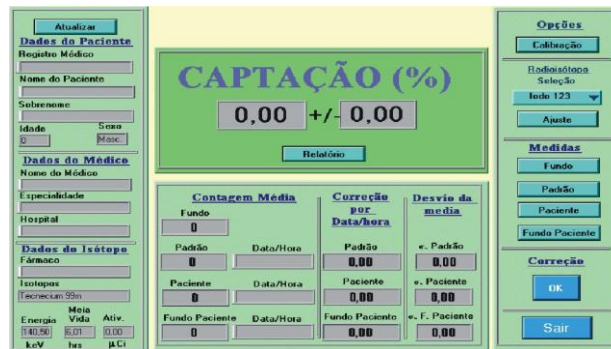
Figure 1. Main screen

to the user the system operation. It allows the user to select the desired function, such as, verification and calibration of the system, and updating of the data of the exam. Once defined the function that the user has chosen, a corresponding window will appear in the screen. At the end of the procedure, the graphic interface informs to the user, through the main screen, the value of the percentile uptake of the iodine absorbed by the thyroid gland. The main screen is shown in figure 1. Figure 2 shows the screen of data entry. This screen is shown when the option selected in the main screen is UP TO DATE.