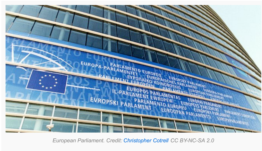
European Parliament.

that Cameron did this to avoid fueling the eurosceptic fire in the House of Commons for an in-out referendum; Cameron argued publicly about preserving British national interests (p.210). Britain also rejected inclusion in a European banking union. These European reforms, among others, were marked by eurosceptics as significant enough integration to prompt an in-out referendum, and led to the Conservative backbench rebellion (p.215). The rise of UKIP further jeopardized Cameron and his party, and the need to move forward with a referendum on Europe. Liddle sympathizes that, much like Blair, Cameron was backed into the referendum, and now finds himself in the difficult position of having to win an “in” vote, amid party opposition. Liddle points that a “yes” vote could be a watershed moment for the Conservative party – representing a party split akin to only several in party history.