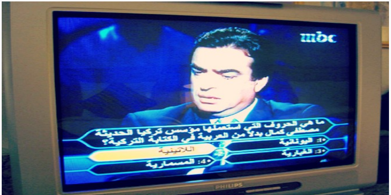
Who Wants To Be A Millionaire, on Dubai-based channel MBC.