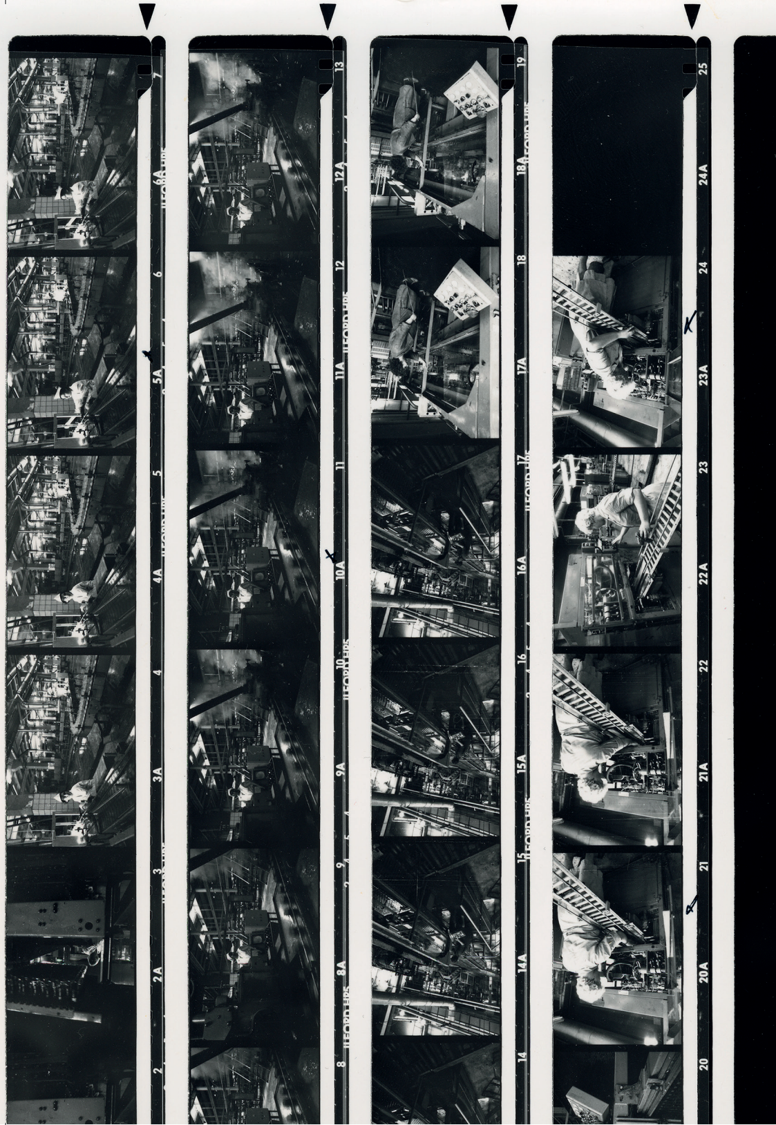
Contact sheet from Women Workers, Russia , 1989, Franki Raffles. StAUL: 2014-4-SW038