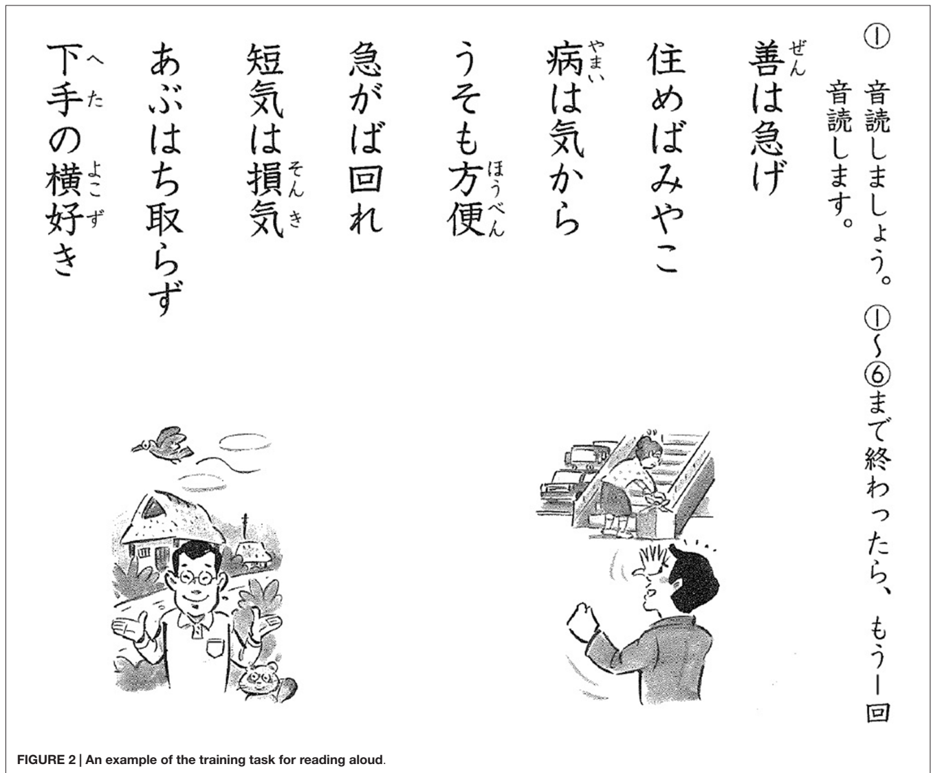
FIGURE 2 | An example of the training task for reading aloud.

control group in the cognitive training studies compared to use a waiting list control group. However, to use an active control group, we should consider an ethical issue. Using the active control group should be “a reasonable balance of the level of benefit to the time investment required of participants in the treatment group” (Street and Luoma, 2002). An active control group with meaningless and worthless tasks is not suitable. In the cognitive training research field, there is no standard and appropriate task for the active control group. The choice of an active control condition must be considered within costs, research questions and ethical considerations. Additionally, results of previous intervention studies (Clark et al., 1997; Mahncke et al., 2006) reported that a placebo group was unnecessary for study of this type because no difference existed in cognitive or functional improvement between the placebo and no-social-contact groups (control group). Moreover, using the waiting list control group had “the advantage of letting everyone in the study