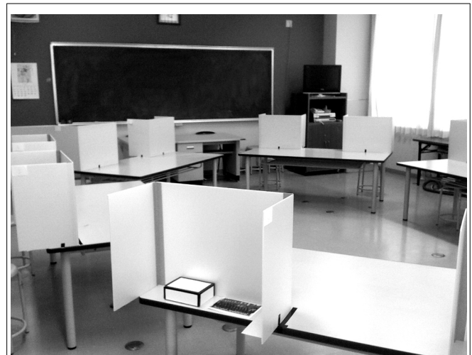
FIGURE 2 | Photograph of the experimental environment in the private condition. In the public condition, the vertical plastic boards and the lids of the boxes were removed.

Children were told that, if they wanted to give the chocolates to a recipient, they should put the chocolates into the box, but if they wanted to keep the chocolates for themselves, that they should put them into the envelope.