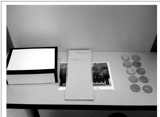
FIGURE 1 | Photograph of the top of a desk in the private condition (left, box with lid for the recipients' chocolates; center, envelope for the child's own chocolates and image of classmates; right, 10 chocolates).