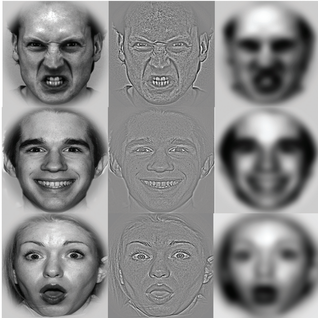
FIGURE 1 | Example stimuli. Normal broad spatial frequency (BSF) angry, happy, and surprised faces (left column), high spatial frequency (HSF) faces (middle column), low spatial frequency (LSF) faces (right column).