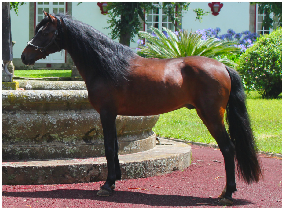
FIGURE 2 | Trovão – Founder stallion of the Terceira Pony (height at withers 1.29 m).