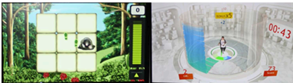
FIGURE 1 | Screen captures from game play of The Mole from SilverFit (left) and LightRace in YourShape: Fitness Evolved (right). The left panel shows the easy level of The Mole , with the green feet representing the player, and the target, a mole, in the middle right square. The right panel shows game play of LightRace where the player steps on the front (left) panel, the correct target, turning the specified area on the screen green.

All participants played each exergame on two difficulty levels, Easy and Medium, with five 1-min trials for each game and level, giving a total of 20 trials for each participant. Each exergame was demonstrated to the participant and each participant received one try-out trial for each game and level before playing the five recorded trials. There was a 1-min break after each trial, and a 5-min seated break between levels and games. The games were played in counter-balanced order across participants, and they always started with the easy level of the game. One researcher stood near the participant to ensure safety while playing the exergame. After each game level, the participants marked the BORG Perceived Exertion Scale (score 6–20) (Borg, 1998)