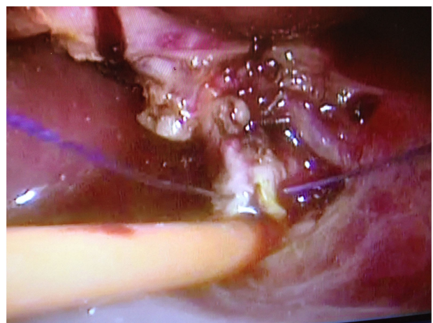
FIGURE 2 | The T-tube is inserted into the common bile duct and the incision is sutured around the T-tube.