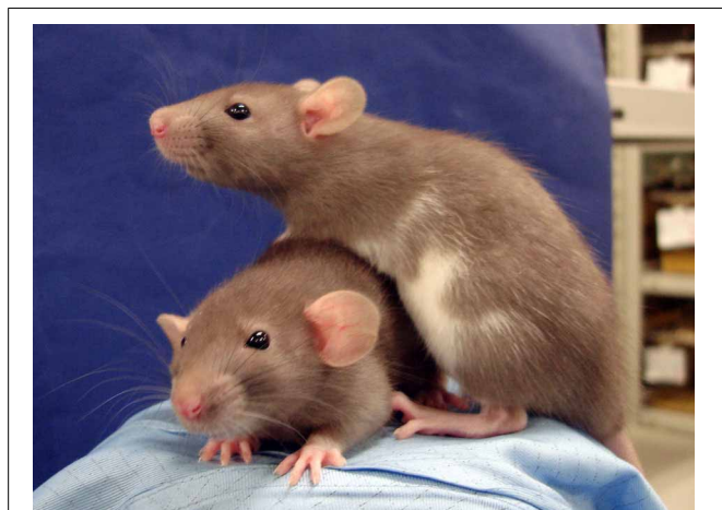
FIGURE 1 | Rats exhibiting normal (top) and Dumbo (bottom) ear phenotypes Kuramoto et al. (2010).

Extensive evidence for conserved CNE enhancer function probably exists in the gene pool of the diverse vertebrates for which we