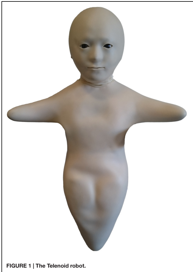
FIGURE 1 | The Telenoid robot.

The Telenoid is "designed according to minimum requirements to express humanlike appearance and motion"