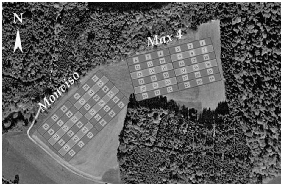
FIGURE 1 | Study design. Numbers indicate vegetation sampling plots.

Besides the development of species richness and vegetation coverage, several floristic attributes were analyzed to characterize the ground flora of the studied short rotation coppice. Ellenberg indicator values for light (L), moisture (F), reaction (R), and nitrogen (N) were used. According to their apparent requirements plants are ranged along a nine point scale; the closer a species' value to 9, the more it is connected to this indicator. Of all recorded species included in the Ellenberg indicator list the arithmetic mean of Ellenberg indicator