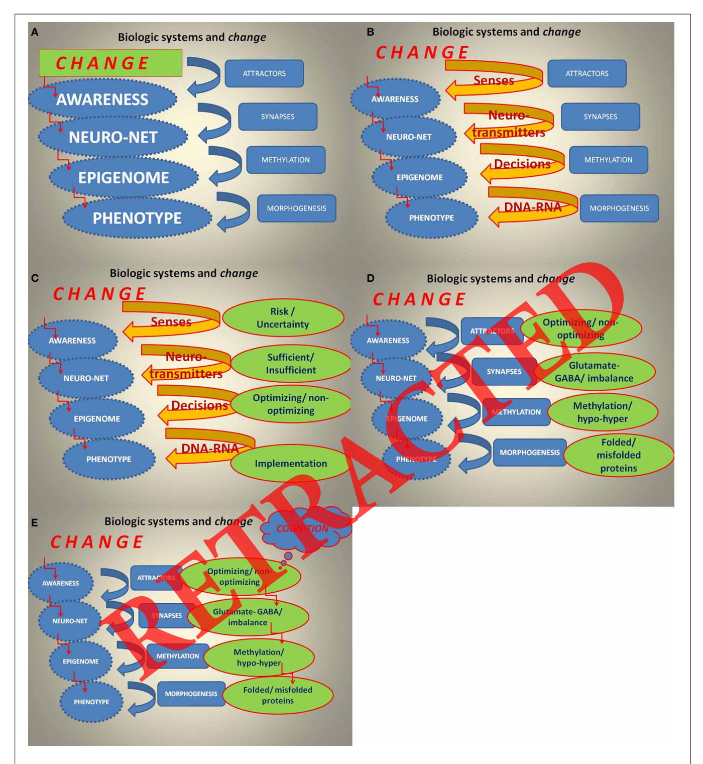
FIGURE 2 | (A) Schema of propagating change through functional and structural levels of a biologic system. (B) Propagating change paths. (C) Options that may activate system's paths. (D) Alternatives that may be present at system's paths. (E) Initiation of system's processes and selection of options by cognition.

(intrinsic muscles of the hand, vocalis, and orbicularis occuli muscles).