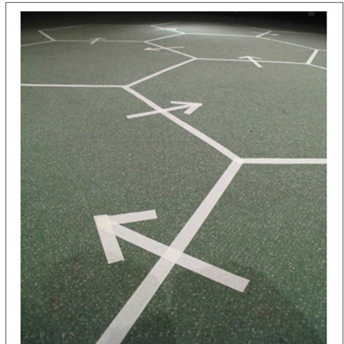
FIGURE 1 | Photograph of the dance floor showing the taped hexagons. The hexagons were connected by a series of arrows outlining a path to be followed by the participants.

Prior to participants' arrival, the dance floor had been divided into a series of 10 interlocking hexagons using white adhesive tape, each hexagon measuring 1.25 m in diameter. The hexagons were compactly configured, and a series of arrows delineated a path from one hexagon to another to be followed by participants during the experiment; see Figure 1 . Before the experiment, participants were instructed to move between the hexagons via