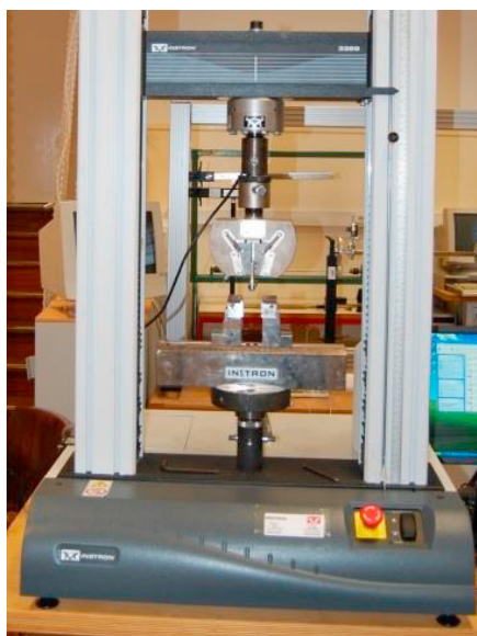
Fig. 1 – Instron 3369 testing machine