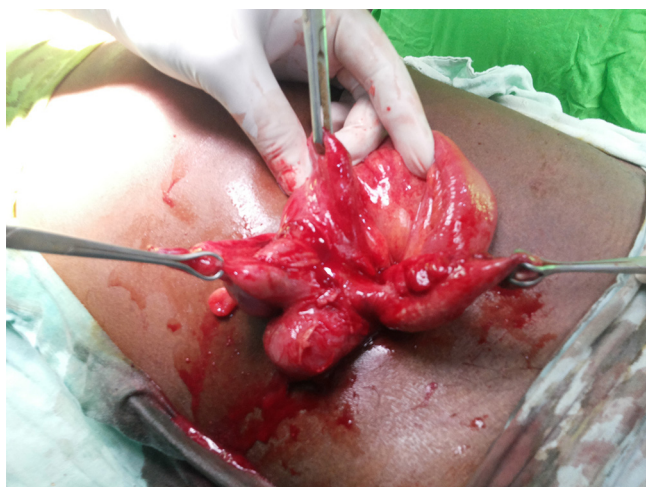
Fig. 1. Two appendices located symmetrically on either side of the ileocaecal valve.