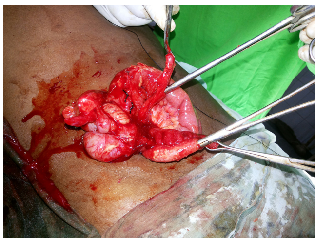
Fig. 2. Part of circumference of tubular structures is cut and artery forceps were inserted.