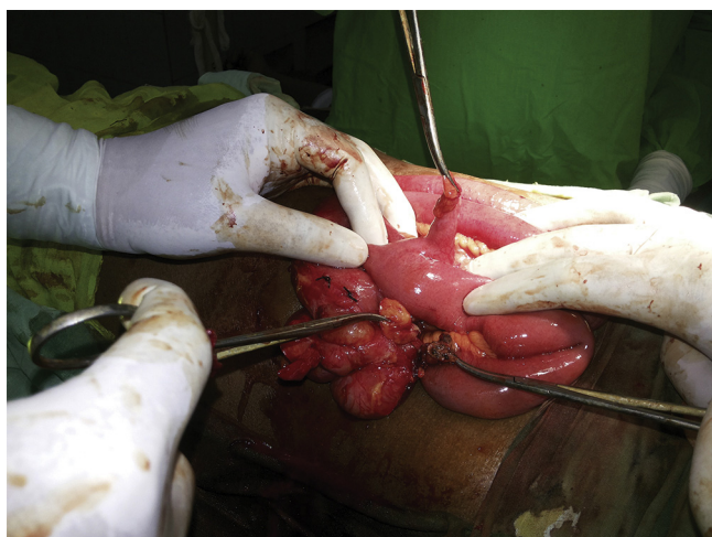
Fig. 3. Presence of Meckel's diverticulum over the antimesenteric border of ileum.

Both the appendix were removed and sent for histopathological examinations. Then we checked for presence of other anomalies, incidentally we found a Meckels diverticulum over the antimesenteric border of ileum around 2 feet from the ileocaecal junction