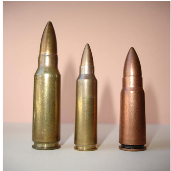
Figure 1. Examples of modern military rifle cartridges: 7.62 mm NATO (left), 5.56 mm NATO (chambered in the M16 rifle) (middle), 7.62 × 39AK–47 (Kalashnikov) (right). Military ammunition terminology uses metric system with bullet diameter expressed in mm.

(Figure 1), which improves their ballistic performance at the supersonic velocity range. With the exception of the newest lead-free designs, these bullets have the typical composition of a lead (“soft”) core protected against friction from the barrel by a shell (“jacket”) of harder metal such as a copper alloy or plated steel, which completely covers the lead core at the nose (but remains open at the base for manufacturing purposes) in order to prevent deformation during soft tissue penetration, a construction designated as full metal-jacketed (FMJ) [13,20,25]. FMJ handgun bullets have round or flat nose.