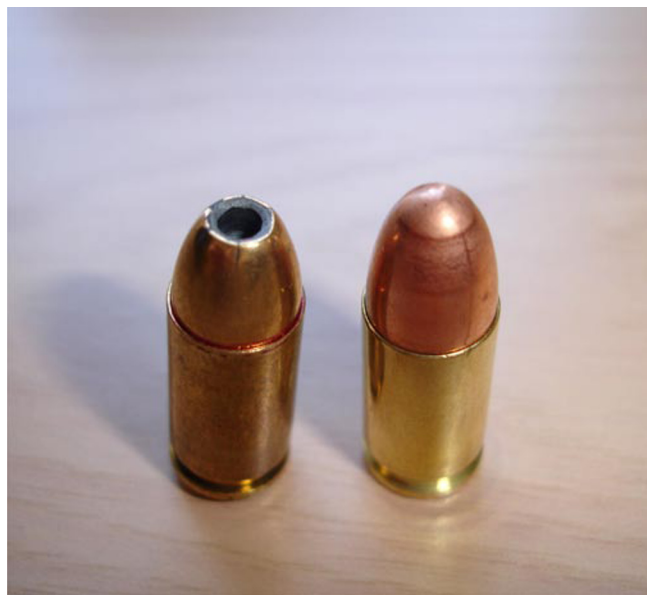
Figure 3. Different handgun bullet construction: semi-jacketed hollow-point (SJHP) on the left, and full metal-jacketed round nose (FMJ RN) on the right. Both cartridges are 9 mm Luger.

When an FMJ bullet penetrates tissue, the resistance encountered resulting in its retardation affects its stability and occasionally its integrity, because tissue density is about 800 times greater than that of air and the spin can no longer maintain the bullet's previous orientation [29]. Over a certain distance, which varies depending on the type of the bullet, yawing becomes irreversible, and within a sufficiently long path tumbling eventually occurs, thereafter the bullet advancing base-forward [16,17,30] (Figure 2).