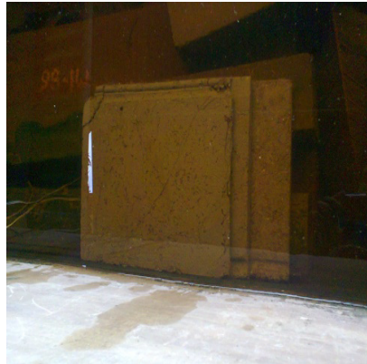
Fig 7 .Specimens in water for water absorption test

The test specimen were dried in an oven at a temperature of about 105-110 C prior to the test. Dry weights were measured after atmospheric cooling and were immersed in clean water at room temperature (24-30°C) for about 24 hrs (Fig 7). The specimen was then removed from water and surface dried and weighed. The increase in weight with respect to the original dry weight was taken as the water absorption for that sample. Mean water absorption of the three samples was taken as the water absorption of the prepared mix. A sample set of results obtained is given in table IV. IS specifications for MP tiles advocates that its water absorption should not be more than 18% (for class AA) and 20% (for class A) of its weight. As per Peñamora and Melencion [7] a cement concrete tile should not absorb more water than 6% of its dry weight during 24 hrs in a water bath. A slightly higher value of water absorption% is mainly due to the presence of coir fibres