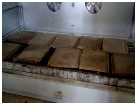
Fig. 6. Specimens in hot air oven for dry (or temperature) curing

After 24 hours, the moulds were stripped off and the specimens were kept in a chamber (hot air oven) at 45 0 C to accelerate curing as shown in Fig 6 . The specimens were cured for 5 days. While curing, the tiles should not be allowed to dry out and hence, moisture was applied on the surfaces of the tiles on each day.