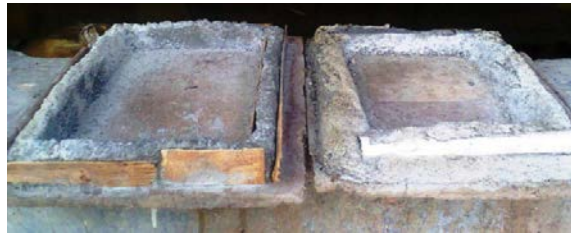
Fig. 9. Permeability test