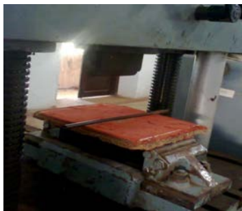
Fig. 8. Testing of specimen in UTM

Three tiles were tested after soaking them in water at 27 0 C for 24 hrs in the wet condition using 30 T- UTM. The tiles were placed evenly flat-wise on the bearers set with a span of 27 cm, resting on the bottom surface (Fig 8). The load was applied in a direction perpendicular to the span, at a uniform rate of 450 to 550 N/min.