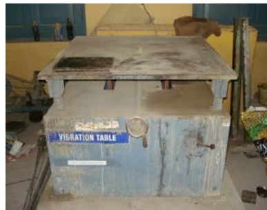
Fig 5. Tile under Vibration

The required quantity of cement, fine aggregate, coir fibres (10% replacement of cement) and water were weighed and a cement composite mix was prepared. The mixing was continued until a uniform mix of required consistency was obtained. The mix was then filled in the prepared moulds after placing a plastic sheet on the mould for easy demoulding. A table vibrator (Fig. 4) was used to compact the mix within the mould. After compacting, the mould cover was removed carefully and the top surface was levelled using a trowel, whenever necessary. Then the specimens were kept undisturbed for 24 hours.