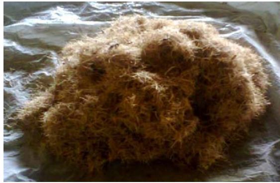
Fig. 2 Coir fibre used in the study