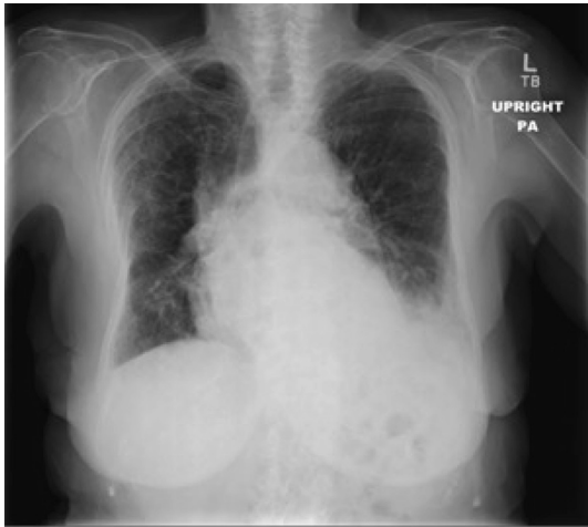
Figure 1. Plain radiography in the upright position showed a slightly enlarged heart size with a parenchymal opacity visualized in the left lower lobe, which partially silhouetted the left hemidiaphragm and obscured the cardiac apex.

Transthoracic echocardiogram 5 weeks prior to admission revealed mild aortic stenosis with the aortic valve peak velocity 2.2 m/s and the aortic valve mean gradient of 11 mmHg, mildly dilated left atrium, normal left ventricular systolic function with ejection fraction of >55%, Grade I diastolic dysfunction, and mild to moderate increase of the estimated systolic pulmonary artery pressure (50–55 mmHg). A pulmonary function test, which was done during the same period of time, showed forced expiratory volume in 1 second (FEV1)/forced vital capacity (FVC) 79% of predicted, FVC 59% and FEV1 63% of predicted, FVC 63% of predicted, total lung capacity 53% of predicted, suggestive of restrictive pattern.