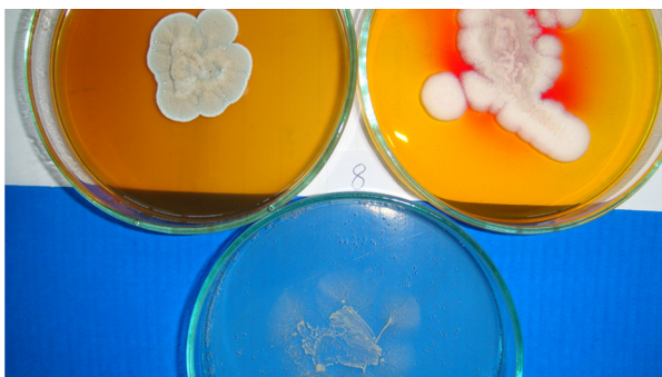
Fig. 2 – Trichophyton terrestris . Sabouraud dextrose agar (left), dermatophyte test medium (right), corn meal agar (bottom), 25 °C, 7 days. Surface of colony.

high (40×) power objectives to observe the fungal elements and diagnostic morphology.