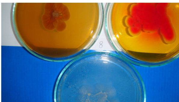
Fig. 3 – Trichophyton terrestris . Sabouraud dextrose agar (left), dermatophyte test medium (right), corn meal agar (bottom), 25 °C, 7 days. Reverse of colony.

Dermatophytes were isolated from 19 of the 264 (7.1%) samples. The most frequently isolated fungi were: T. terrestris (4.1%),