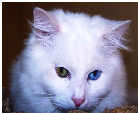
Fig. 1 – A clinically healthy Van cat.

Each sample was divided into two portions, one portion was used for direct microscopic examination and the other was used for culture. Direct microscopic examination was performed after the sample was placed on a slide and 30 µL of 15% potassium hydroxide (KOH) added. After 5 min., the wet preparation was carefully examined under both low (10×) and