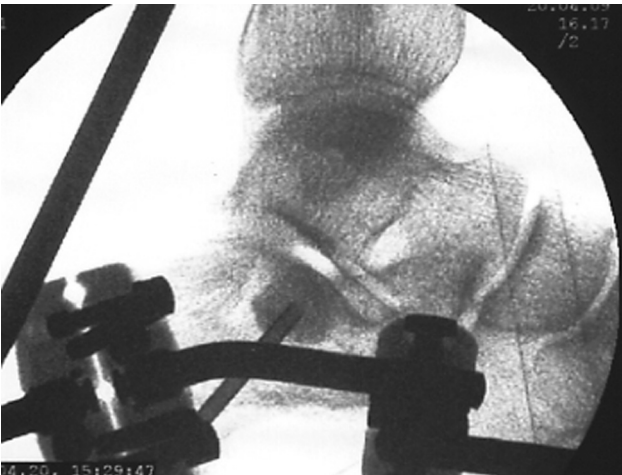
Fig. 4. Second surgical stage. Posterior talar articular facet of the calcaneus is restored with bone substitute injected to fill the bone defect after the fragment has been raised.