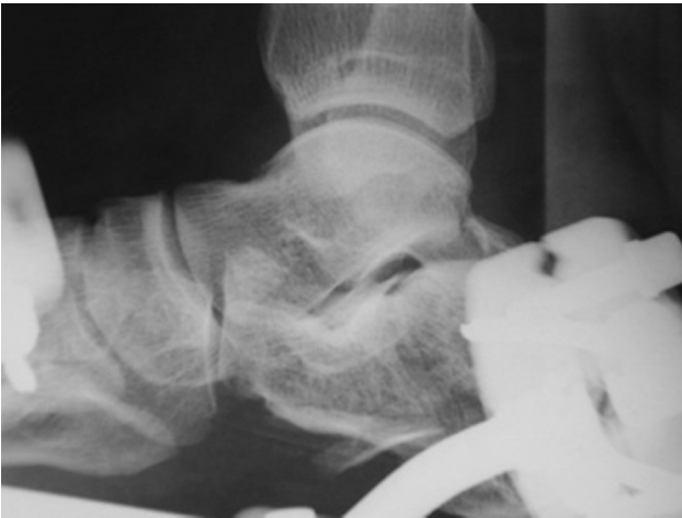
Fig. 3. Post-operative X-ray verification of the subtalar joint. The overall morphology of the calcaneus has been re-established.