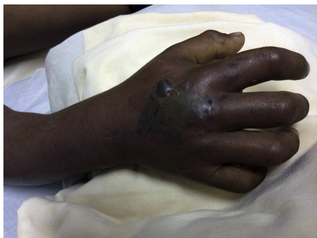
Fig. 1. Snakebite wound with associated necrotizing fasciitis.

A nine year old boy, living in rural Cambodia, presented to a hospital two days after being bitten on the forearm by a cobra. The patient was febrile, tachycardic and complained of increasing pain and swelling to his arm. The wound had developed an infection, resulting in necrotizing fasciitis (see Fig. 1 ), with erythema having spread to involve the whole arm, portions of his neck and chest wall. Surgeons carried out extensive debridement (see Fig. 2 ) and