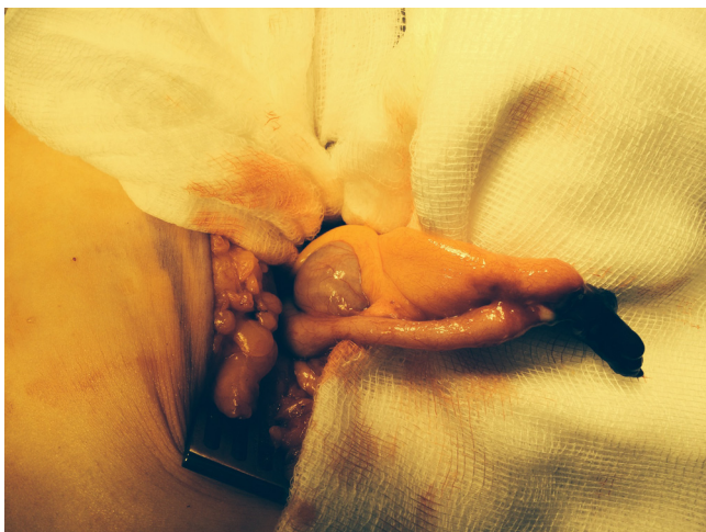
Fig. 1. The vermiform appendix delivered from McEvedy's approach.

[4]. This means this condition mostly presents like an incarcerated femoral hernia rather than an appendicitis.