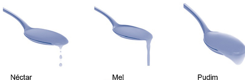
Figure 1 Classification of consistencies – National Dysphagia Diet Guidelines (2002).

gums, manufactured by Support®) and offered immediately after preparation, according to the recommendations of the National Dysphagia Diet Guidelines. 13