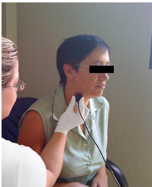
Figure 2 Transducer placement position in the patient.

The statistical methods used in the study were the inferential technique and significance test. To analyze the significance of data obtained from acoustic parameters between elderly and adult groups in each consistency and in each volume, Student's t-test – equal variance of two