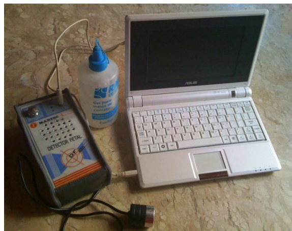
Figure 3 Ultrasonic detector (portable), DF-4001, Martec.