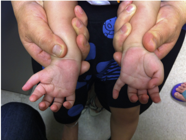
Figure 1. A clinical photo of H.L. showing wasting of the right thenar eminence.