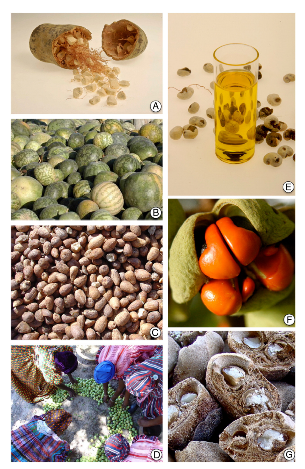
Fig. 2. (A) Fruit and seeds of Adansonia digitata ; (B) Citrullus lanatus fruit; (C) seeds of Ximenia americana ; (D) women gathering fruits of Sclerocarya birrea ; (E) pressed oil and seeds of Adansonia digitata ; (F) seeds of Trichilia emetica ; and (G) seeds of Sclerocarya birrea.