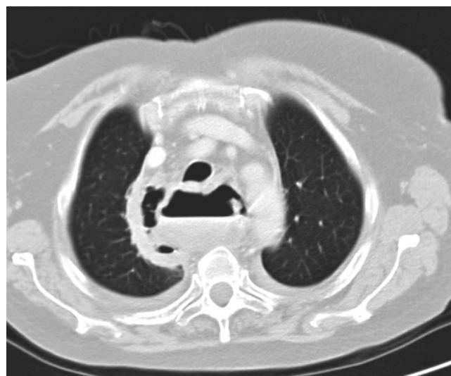
Fig. 2. Mediastinal leakage from oesophageal rupture.

Early diagnosis and management of oesophageal perforation is difficult but imperial in reducing morbidity and mortality. 5,6 Whether surgical or conservative treatment is indicated depends mainly on the general health of the patient, time elapsed and the size of the perforation. Thoracic oesophageal perforations are usually differentiated in those contained within the mediastinum and those noncontained that drain into the pleural space as with our