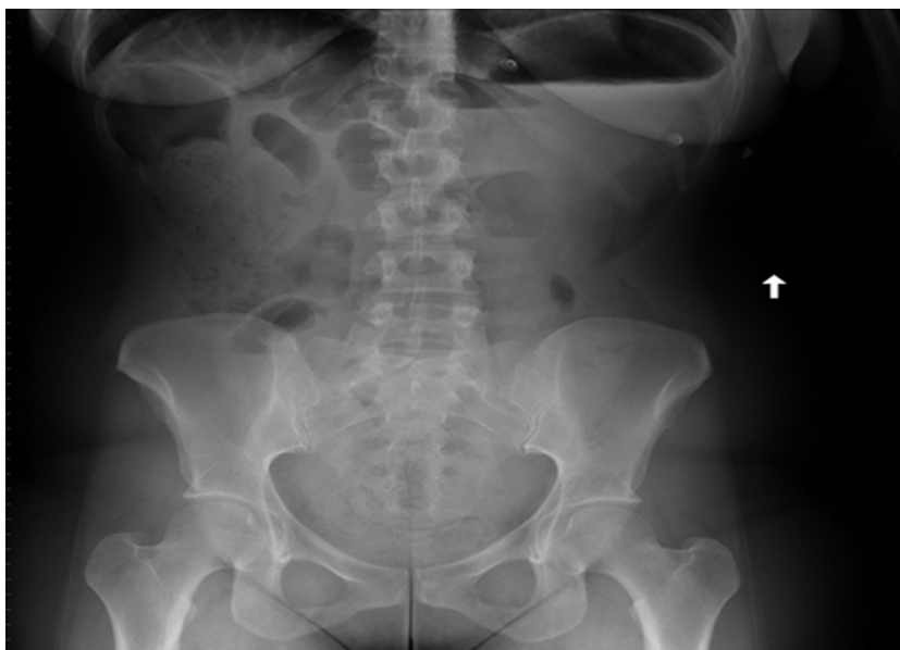
Fig. 3. X ray: gas distension of some intestinal loops in epigastric and right-hypochondriac region with a single air-fluid level in epigastric region.

[10,11]. The first case of falciform hernia was described in 1929 and each decades is characterized by an increasing number of new cases, as such as there is an ever-increasing rate of cases done laparoscopically. This evidence suggests logically the association between the two events [10,15,16]. In the above-described case, the defect did not appear to be iatrogenic because the patient had never undergone abdominal surgical procedures. The nonspecific clinical and laboratory features give to the radiological findings a big role in the diagnosis and the planning of surgical treatment [13].