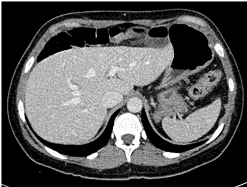
Fig. 1. CT scan: interposition of right colon between anterior abdominal wall and liver. In left paramedian area one of these loops has thickened wall and perivisceral fluid and appears to reduce its caliber.