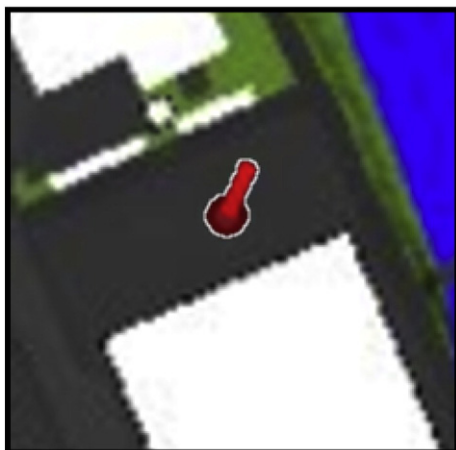
Fig. 3. Tablet interface for viewing and controlling the position in a Simmetry3d visualisation.

Although the initial tablet app could be used in the VR lab or in conjunction with a laptop, it still meant access to the visualisations required physical access to the computer running the 3D visualisation software. Should a designer want to work remotely with the prototype, this would mean that they would have to carry a laptop. The missing element was the ability to transmit images generated from the 3D model to the tablet. The implementation of this functionality allowed the tablet interface to receive an image of the 3D model on-demand. The tablet