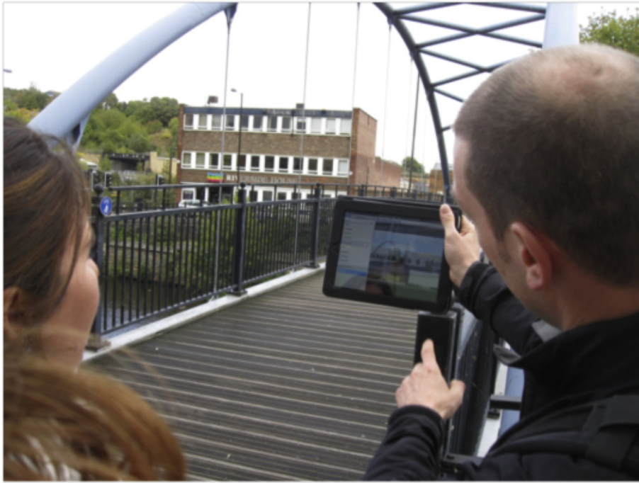
Fig. 4. Tablet device displaying an on-demand visualisation on-site© Sigrid Hehl-Lange.

of rendering the model, which means planning departments would be able to host the model online.