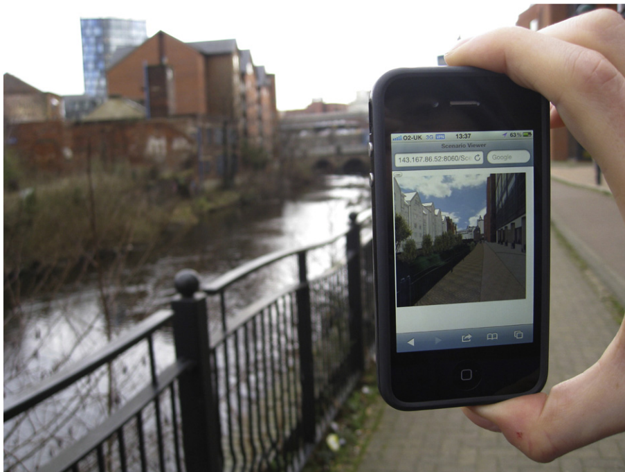
Fig. 5. Smartphone showing an on-demand visualisation of a redevelopment proposal through a web browser.

Using the GPS and the compass automatically to both ascertain and transmit location and direction was possible. When the mobile device