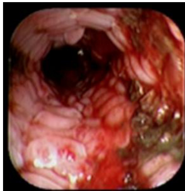
Figure 2 The image shows the presence of tissue embedment along the covered portion of the PSEMS.

With the possible new applications of PSEMS in benign GI disease, one of the main concerns is about the duration and characteristics of the cover. The currently available esophageal stents are easy to insert and can usually be removed safely within a few weeks of the placement. 6 Actually, the PSEMS are not FDA approved in benign GI diseases,