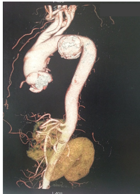
Photograph 2 Sacciform aneurysm.