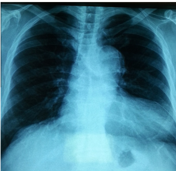
Photograph 1 Chest X-ray cardiomegalia.

We monitored the arterial oxygen saturation (SpO 2 ) at the level of the two upper limbs, a desaturation (SpO 2 = 89%) was noted for twenty minutes on the left side which was normalized after (SpO 2 = 98%) testifying the obstruction of the left SCA and the eventual SCSS.