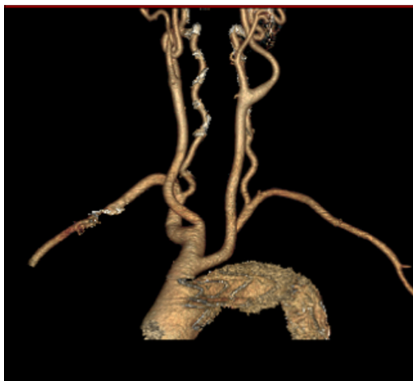
Photograph 4 Thrombosis of the left subclavian artery.

One of these problems is the management of the left SCA. In fact up to 40% of patients undergoing TEVAR have pathology that extends near the left SCA [4]. In these frequent situations the endografts are typically placed over the left SCA origin and consequently occluding this arch vessel. Robert after review of the literature mentioned that rates of SCA coverage range between 10% and 50% [5].