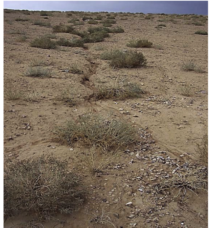
Fig. 1. Vegetation island redirecting concentrated flow around it resulting in deposition on the downslope side.

Plant community physiognomy affects concentrated flow by controlling the connectivity of runoff and sediment sources and the energy of overland flow where it does occur (Williams et al., 2016a, 2014a, 2016b). On well vegetated rangelands, downslope transmission of runoff and erosion generated by rainsplash and sheetflow in isolated bare or sparsely vegetated patches is limited by ground cover or roughness elements that promote infiltration and deposition (Pierson et al., 1994, 2009; Reid, Wilcox, Breshears