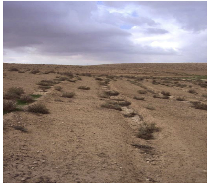
Fig. 4. Degrade watershed that has been restored using Vallerani plow to interrupt concentrated flowpaths and reduce offsite runoff and sediment yield.

Redistribution of water and sediment has been empirically understood and applied to mechanical water harvesting practices. An example is the Vallerani plowing technique used to create zones of water collection and flow concentration feeding vegetated patches (Fig. 4). The Vallerani plow creates a divot and pushes up soil to form a berm (i.e., bund) that traps water from the uphill slope (Gammon & Oweis, 2011). This mechanized water harvesting system provides additional water to the shrubs transplanted into the depression that is necessary for their survival. In addition, a ripping blade is part of the system that is pulled through the soil to improve water storage capacity. While this