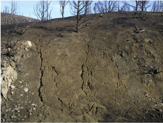
Fig. 3. Concentrated flowpaths formed and are activity eroding as result of loss of protective vegetation and formation of hydrophobic surface soil layer following wildfire in Central Nevada.

match observed temporal declines in erosion rate with time following a major disturbance. In Al-Hamdan et al.'s (2015) model, rill erodibility was initially high immediately after disturbance and exponentially decayed with cumulative runoff over the course of rainfall events.