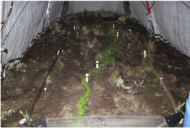
Fig. 5. Release of a dye plume illustrating how runoff is redirect by vegetation clumps resulting in increased tortuosity and reduced sediment transport capacity.