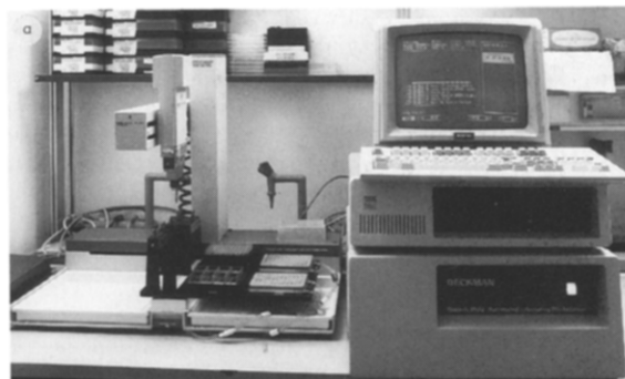
Schema Of The Automated Workstation

Tips and microtiter plates are siliconized with silicone solution in isopropanol from Serva, Heidelberg. Tips are washed