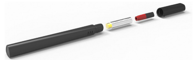
Fig. 1. Schematic of the external appearance and parts of the tested EVP. From left to right, pieces are: the housing, which contains the battery and has a LED indicator on the side, the atomiser, the capsule containing the e-liquid and the mouthpiece.

On Day 5, safety assessment parameters were checked, and subjects answered both the MWS-R and QSU-Brief questionnaires for the last time. Subjects were also provided full verbal smoking cessation advice by the investigator and were discharged from the clinic after all study assessments were performed.