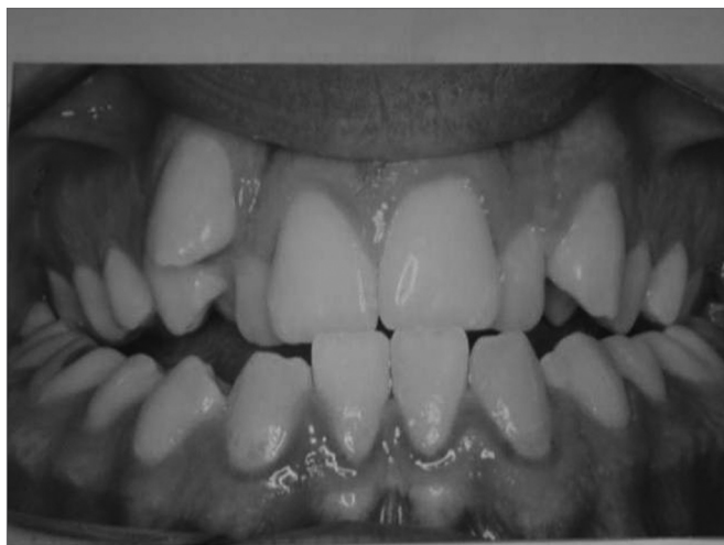
Figure 1. Frontal view of dental occlusion in a patient with maxillary atresia. Note the presence of bilateral posterior crossbite and anterior dental crowding.

The transverse maxillary deficiency is the most frequent maxillary deformity. Patients with this deformity usually presented unilateral or bilateral posterior crossbite and anterior dental crowding (Fig. 1). The distance between the lateral walls of the nasal cavity and the nasal septum is often decreased in the transverse maxillary deficiency. This reduction increases the resistance to nasal airflow and causes nasal respiratory difficulties. 5,6