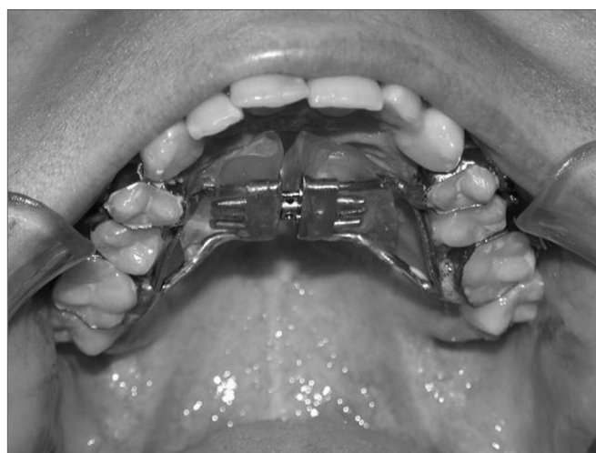
Figure 2. Cemented Hyrax-type expander apparatus (tooth-borne) on teeth before the maxillary expansion procedure.

techniques have been described in the literature. 8-10 The third method for rapid maxillary expansion is to use surgery alone; this procedure is named maxillary expansion by segmented osteotomy. Expansion is attained in this procedure without using any expander; it is done only with segmented osteotomies of the maxilla, and is indicated for transverse deficiencies measuring not more than 7 mm and that are associated with other maxillary deformities requiring surgical correction. 11