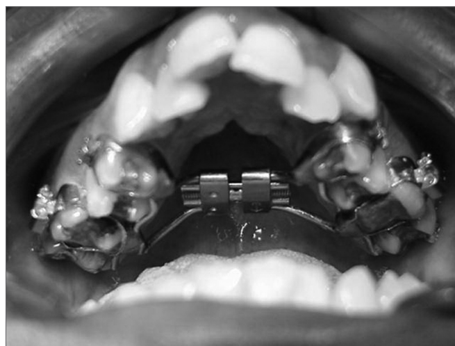
Figure 3. Cemented Haas-type expander (tooth tissue-borne) on teeth before the maxillary expansion procedure.

When the required amount of maxillary expansion is attained the expander should be blocked and kept in position during a 3 to 6-month retention period, depending on the expansion technique and bone neoformation along the midpalatal suture, which may be monitored radiographically by occlusal maxillary radiographs (Fig. 4). The