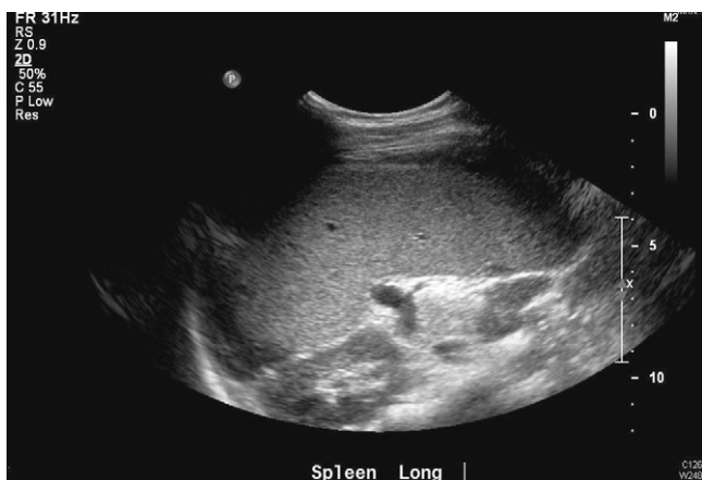
Fig. 1. Urgent abdominal ultrasound showed subcapsular haematoma with a significant amount of complex fluid within the abdominal cavity.

showed subcapsular haematoma with a significant amount of complex fluid within the abdominal cavity, especially the left flank. Emergency laparotomy was performed and a moderate amount of haemoperitoneum was evacuated. The spleen was found grossly enlarged with a haematoma identified on the ruptured capsule (Fig. 3). Splenectomy was performed and peritoneal cavity was washed out meticulously prior to the closure of the abdominal wall. Post-operatively she was recovering in intensive care unit with no blood transfusion required. She was transferred from intensive care unit to ward on day 4 post-operatively. Prior to discharge home on day 8, she was vaccinated for meningococcus, pneumococcus, and Haemophilus influenza.