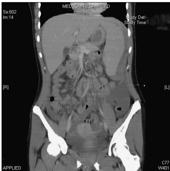
Fig. 2. Computed tomography scan showed subcapsular haematoma with a significant amount of complex fluid within the abdominal cavity, especially the left flank.

Despite the fact that infectious mononucleosis is a self-limiting disease, it may cause serious and lethal complications. The mechanism of splenic rupture secondary to infectious mononucleosis has been controversial. It is commonly believed that it is caused