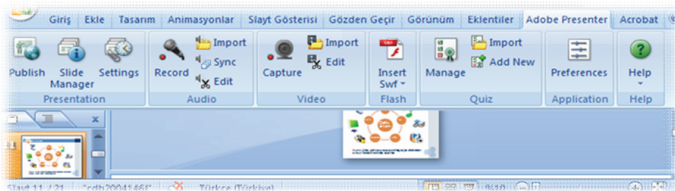
Figure 2. Adobe Presenter menu as an additional to MS PowerPoint

Course content with multimedia objects can be published in three different environments. It is probable to send content to removable CD or desktop file, Adobe PDF document or Adobe Connect Software.