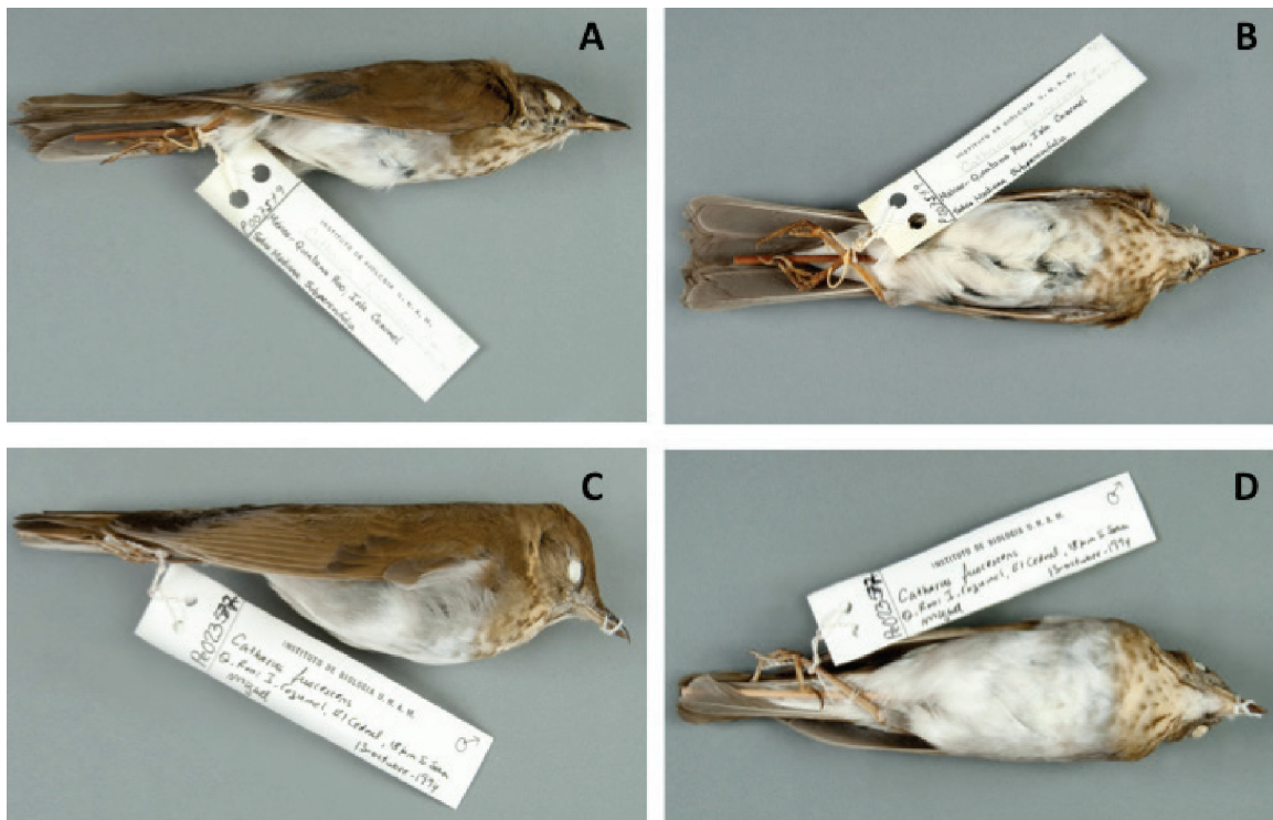
Figura 3. Catharus fuscescens . Specimen 1: A), ventral view; B), right side view. Specimen 2: C), ventral view; D), right side view.