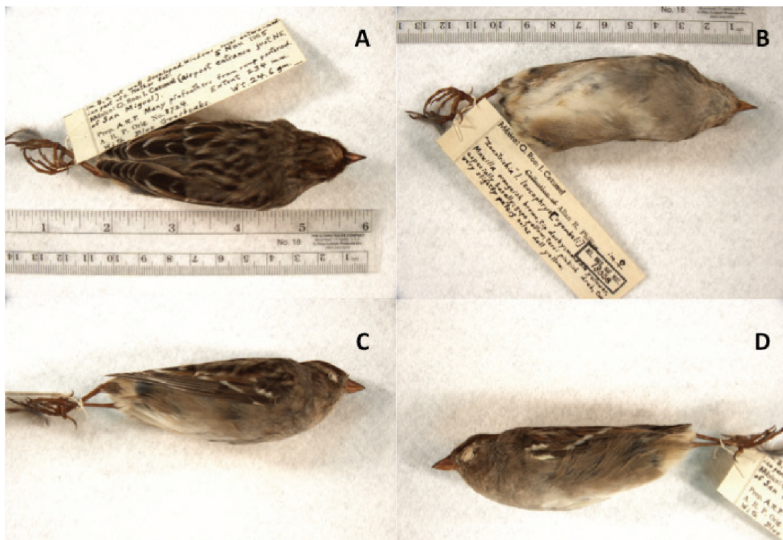
Figura 4. Zonotrichia leucophrys . A), dorsal view; B), ventral view; C), right side view; D), left side view.