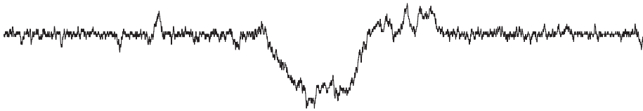
Fig. 1. A simulation of the 1 + 1-dimensional process. The environment has density 0.8 on the first and last third of the interval, and 0 inbetween.

interface in a three-dimensional medium, interacting with an attractive (diluted) potential located in the plane x_3 = 0 . The basic question is the same as above: Determine under which conditions the interface is localized by the potential. The case \omega \equiv 1 has been studied in details recently, see [2] and reference therein. It turns out that in this case too, an explicit description of the set of disorder configurations leading to pinning can be obtained.