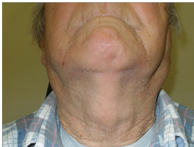
Figure 1. Patient with bilateral parotid enlargement and liposubstitution seen upon MRI.

would justify them, after the pertaining diagnostic investigation, by means of an image exam, laboratorial and/or anatomic-pathological tests (Figure 1). In these cases, our investigation encompasses a complete blood count, antiSSB, anti-nucleus factor, rheumatoid factor, HIV, anti-HCV, Schirmer test, minor salivary gland biopsy, neck MRI, scintigraphy and, in selected cases: sialography.