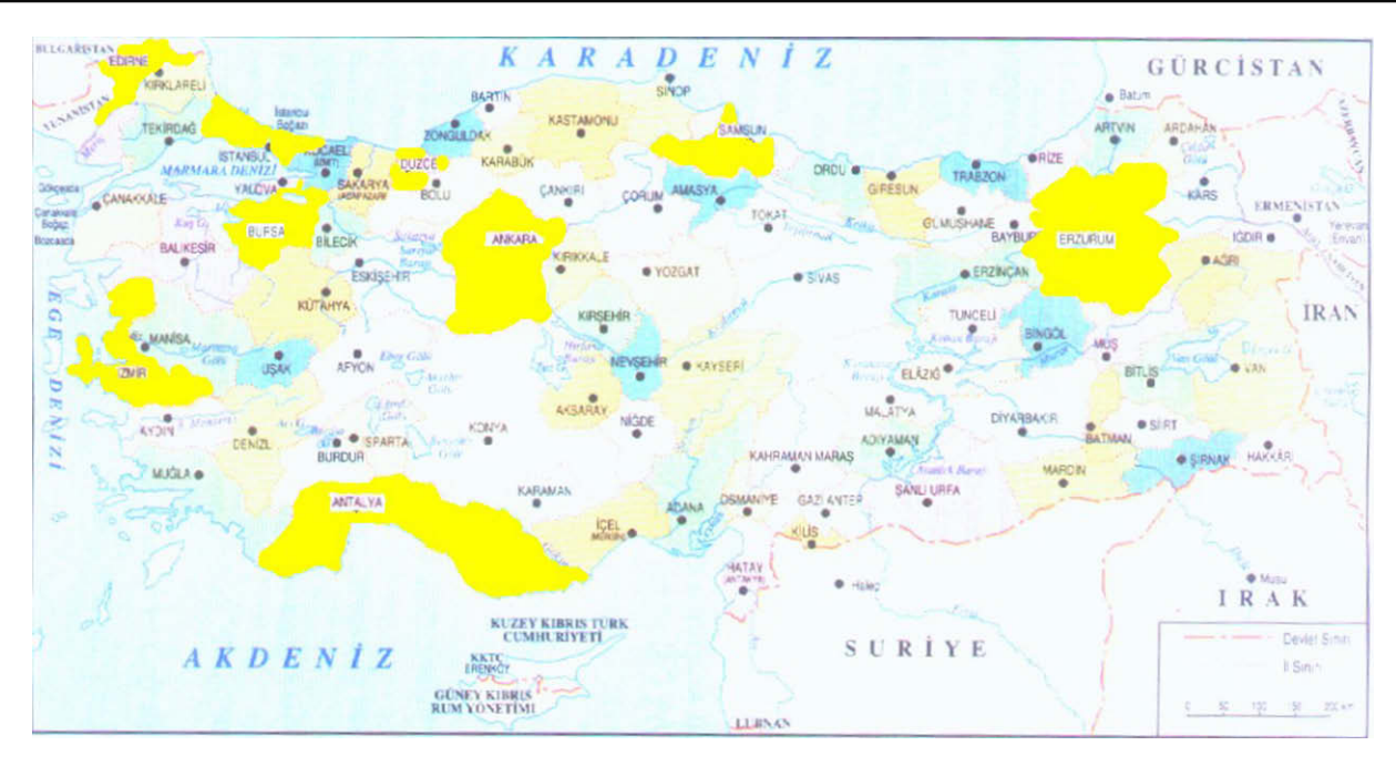
Figure 1 Cities where the study investigators worked.

According to the population of these 12 cities ( F ), annual incidence ( G ) of the disease was estimated (G = D/F).