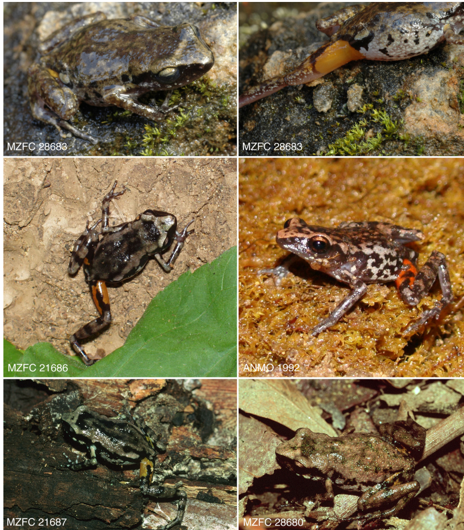
Figure 2. Photographs of Eleutherodactylus syristes . Photos of MZFC 28683, MZFC 21686, and ANMO 1992, and remaining specimens taken by TJD, UOGV, and Peter Heimes, respectively.

conspecific with T. syristes , but did not assign it to any named species.