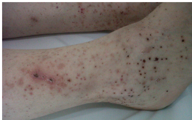
Fig. 1 – Leukocytoclastic vasculitis after 3 years of ADA treatment.

The two groups of patients included in this study were considered to be homogeneous. The median age of patients receiving IFX was 41.3 years, this being similar to that found in the literature in two studies with large patient samples, in which the median ages were 35 and 37 years. 8,13 With regard to the demographic profile of the patients treated with ADA,