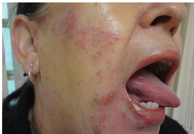
Fig. 3 – Facial cutaneous reaction an IFX-treated patient.