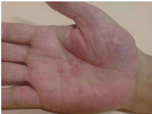
Fig. 4 – Hand cutaneous reaction during IFX treatment.