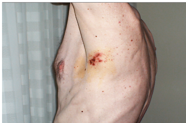
Fig. 2 – Herpes zoster infection during ADA treatment in a patient with severe CD and short bowel syndrome.