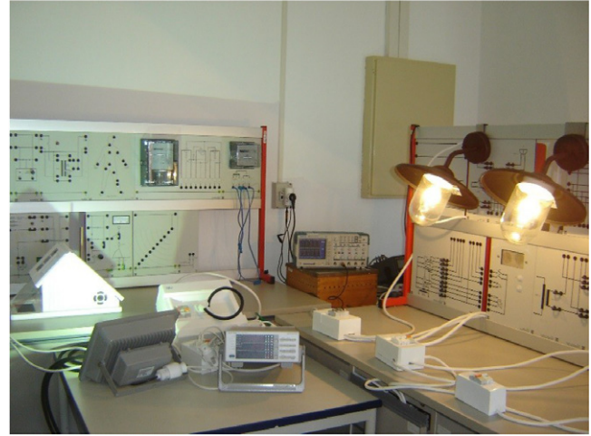
Fig. 4. Experimental setup.

The software allows the introduction of multiple possibilities analysis, allowing the user to choose the analysis of a specific individual point of light, replace the existing technology on a street or in a selected group of streets or replace or control all the luminaires installed simultaneously, undertake investment analyses and advise more efficiently whether this can be chosen