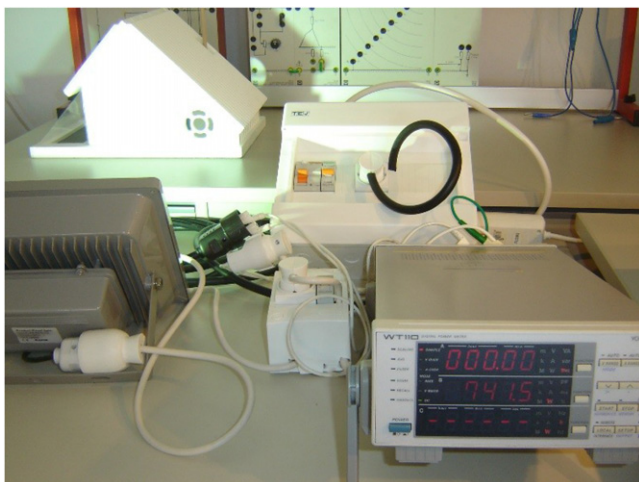
Fig. 5. Measure in the branch (cable) [1, 1], option 1 (end).