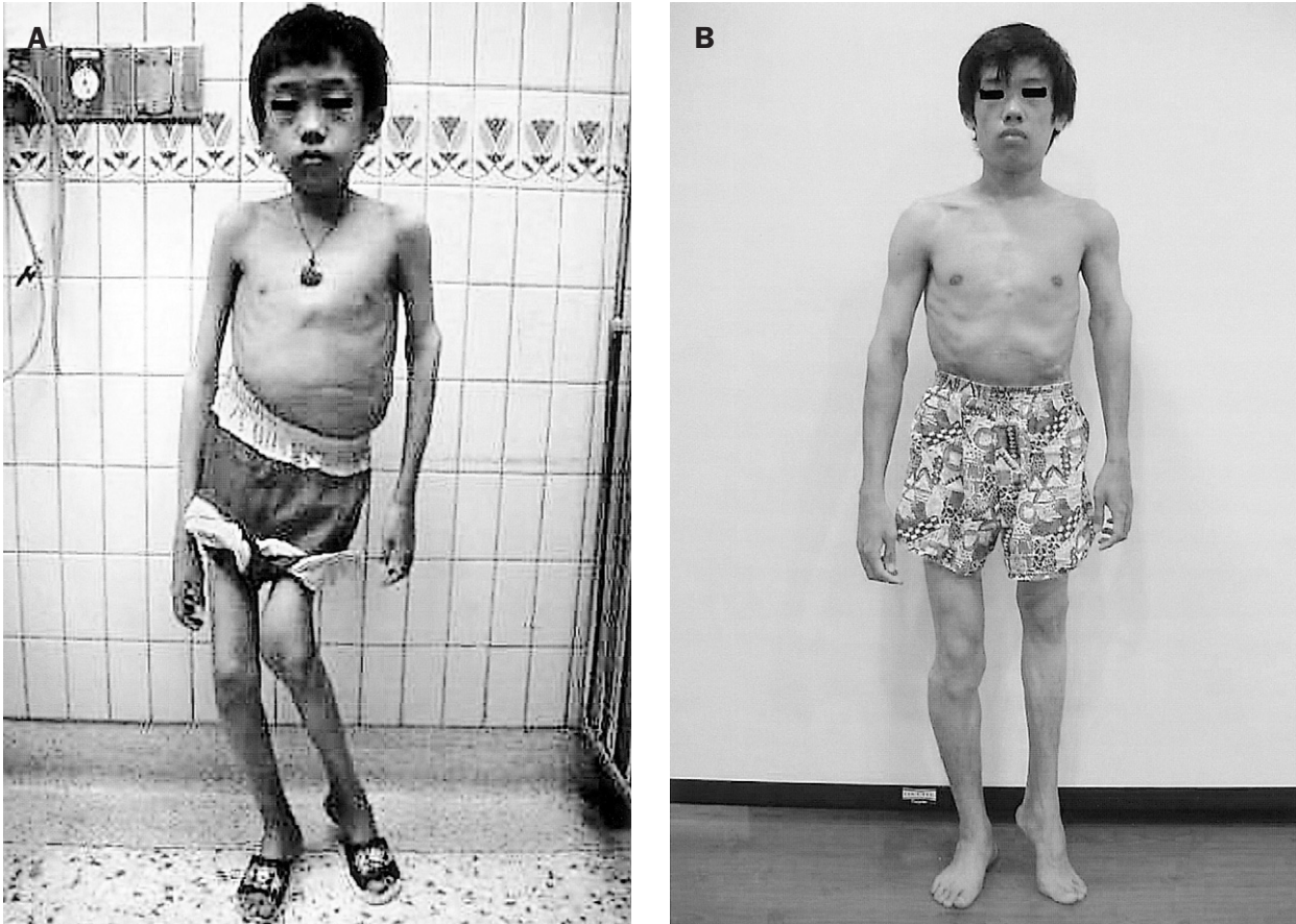
Figure 1. The patient before and after enzyme replacement therapy (ERT). (A) Pre-ERT (12 years and 10 months old); (B) Post-ERT (19 years and 4 months old).