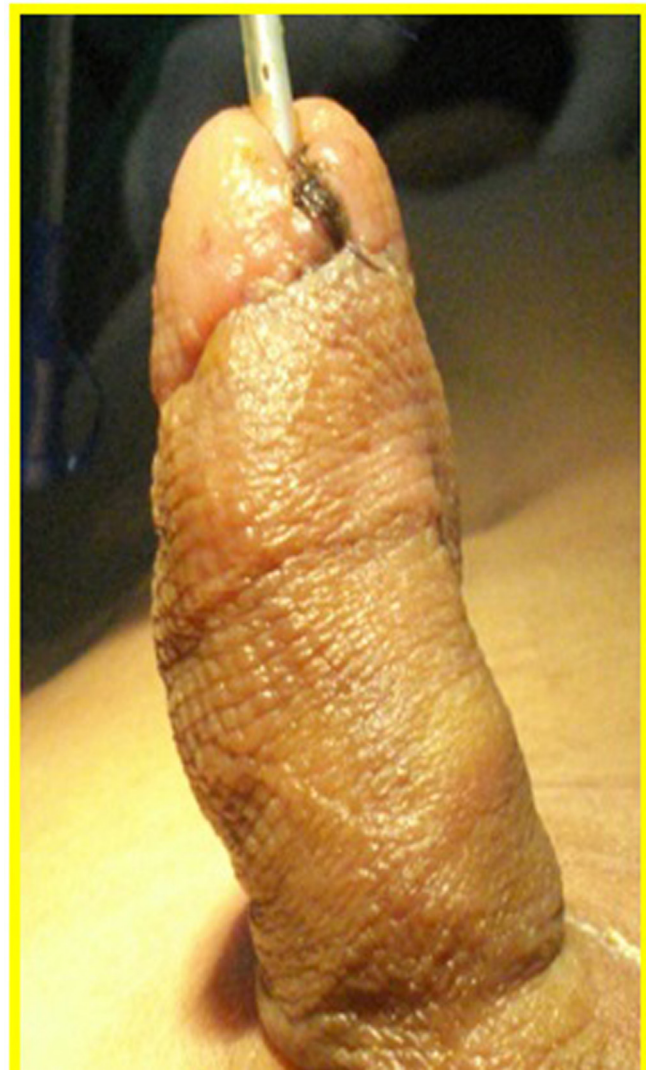
Figure 6 Result on postoperative day 7.

Management of HTS requires a high index of suspicion and early intervention. The causative agent (hair) should be removed promptly to avoid further damage. Useful techniques are the unwrapping technique, the blunt probe cutting technique and the incisional approach. Depilatory creams may also be used, if access to the band of hair is limited due to edema. Once the constricting band is removed, attention must be directed toward the urethra and, depending on the severity of the injury, either end-to-end urethroplasty or URAGPI may be utilized. Using URAGPI, the urethra may be mobilized up