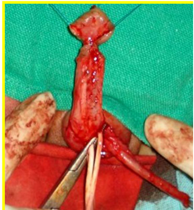
Figure 4 Narrow connection between glans and shaft, seen after degloving.

on the ability and amenability of the urethra to be mobilized and moved up to the tip of the glans in cases of distal hypospadias.